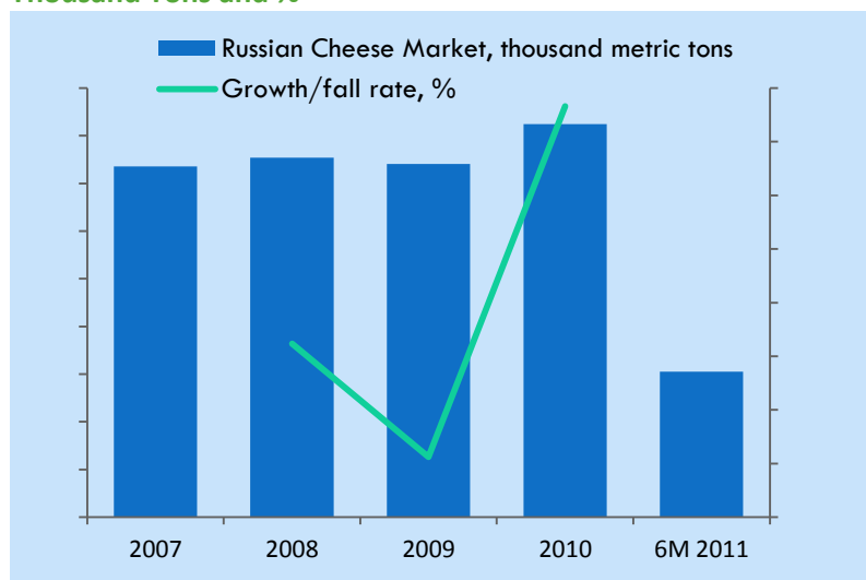
Figure 42. Russian Cheese Market Volume, 2007-6M 2011, Thousand Tons and %

The share of imported cheese amounts to 48.9% of the Russian market.